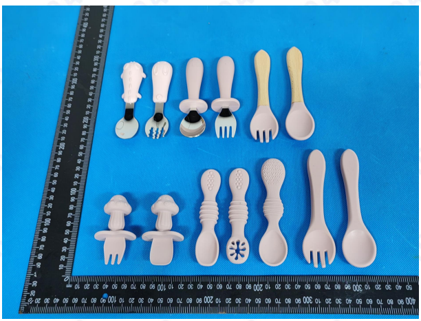
The photo is for use with SOAR original report only.