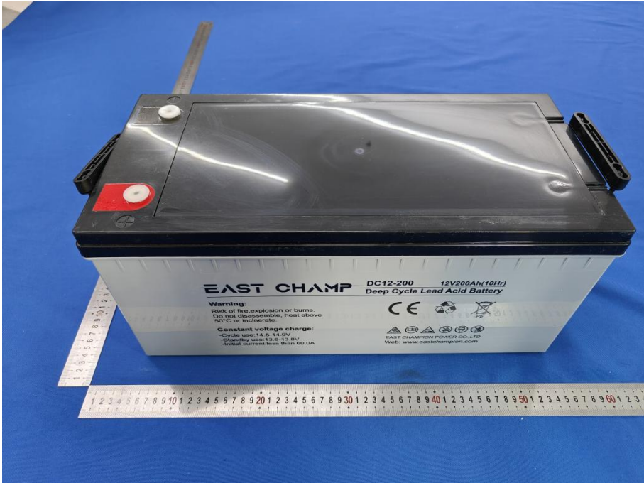
Fig. 2 – Back view of battery: