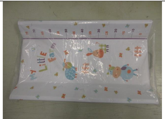
Pic. 6: Packing exhibition