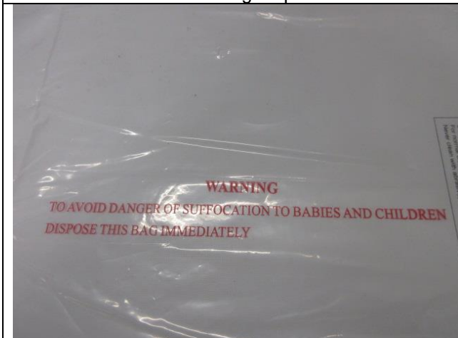
Pic. 7: Marking statements on bag