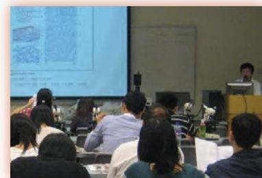
顯微鑑別課程 Microscopic Identification Courses

香港檢測和認證局舉辦的活動 Activities organised by the HKCTC