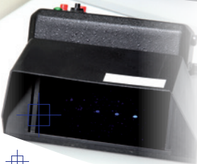
熒光反應 Examination of Fluorescence