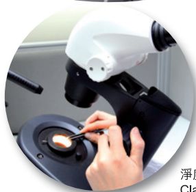
淨度分級 Clarity Grading