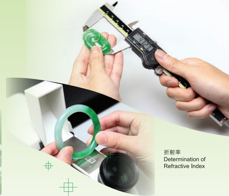
折射率 Determination of Refractive Index