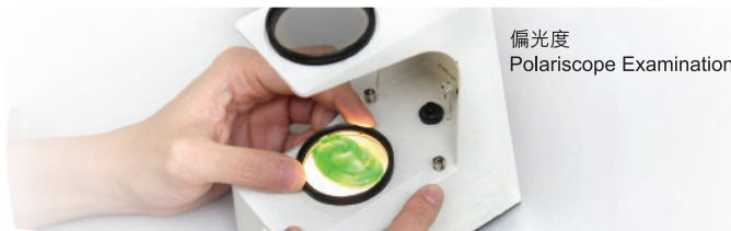
偏光度 Polariscope Examination