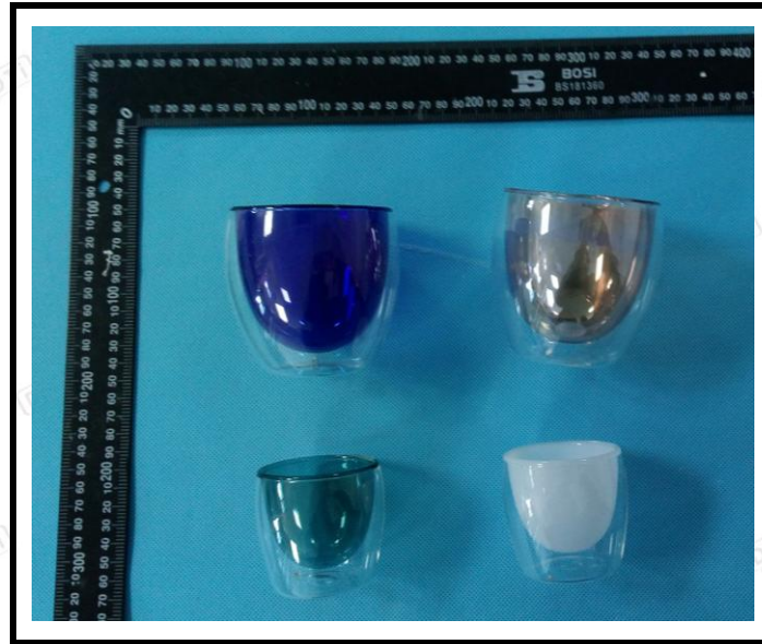
Photograph of Sample

DTI authenticate the photo on original report only