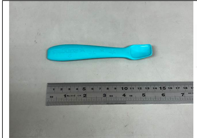
Appearance of the tested