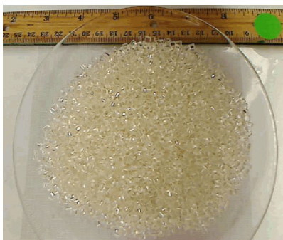
View of content