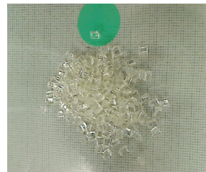
3908.1mg analyzed (1mm x 1mm scale)

Disclosures: All work was done at Beta Analytic in its own chemistry lab and AMSs. No subcontractors were used. Beta's chemistry laboratory and AMS do not react or measure artificial C 14 used in biomedical and environmental AMS studies. Beta is a C14 tracer-free facility. Validating quality assurance is verified with a Quality Assurance report posted separately to the web library containing the PDF downloadable copy of this report.