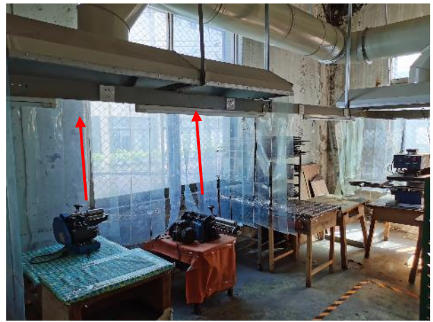
Gluing and screen-printing