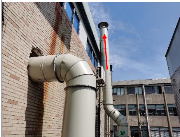
Air emission treatment device