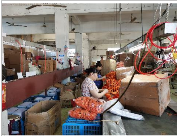
Assembly, inspection and packing