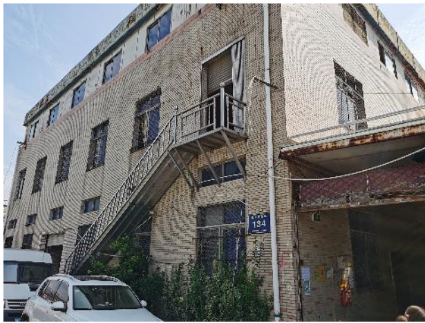
Entrance view from the street of the factory