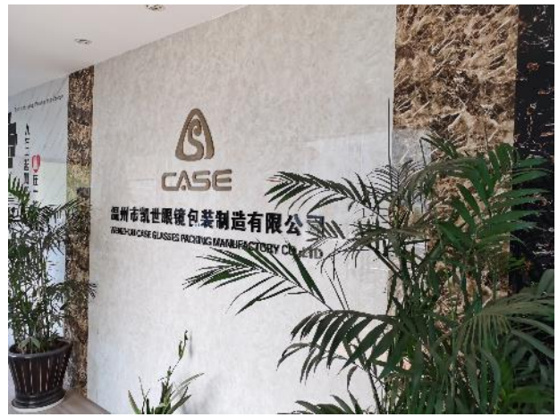
Photo of factory sign