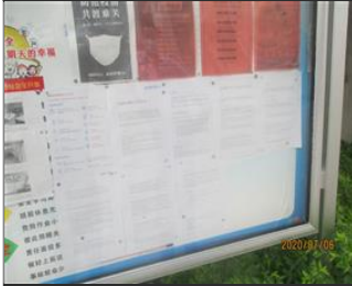
Photo of the code of conduct on display amfori BSCI poster and CoC.JPG