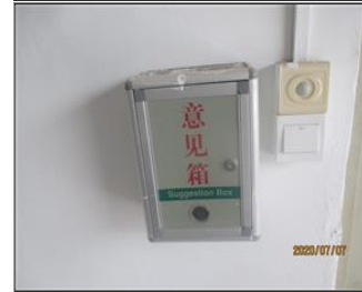
Photo of the inside of the main production hall Suggestion box.JPG