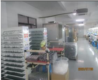
Photo of the inside of the main production hall Testing.JPG