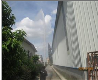
Photo of fire safety equipment Fire hydrant testing.JPG