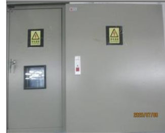
Photo of the inside of the main production hall Warning sign.JPG