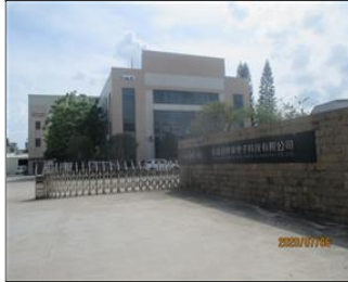
External photo(s) of the production unit(s) Facility name and outlook.JPG