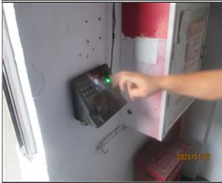
Photo of the inside of the main production hall Attendance machine.JPG