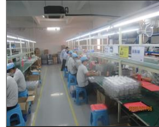
Photo of the inside of the main production hall Assembly area.JPG