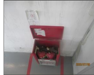
Photo of fire safety equipment Fire extinguishers.JPG