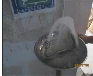
Photo first aid facilities Eye washing station.JPG