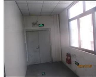
Photo of fire safety equipment Safety exit.JPG