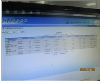
Photo of non-conformity NC 5.5 insufficient social insurance.JPG