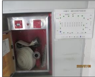
Photo of fire safety equipment Fire hydrant.JPG