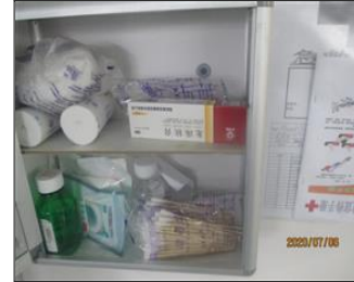
Photo first aid facilities First aid kit.JPG