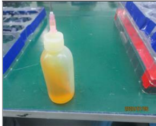
Photo of non-conformity NC 7.7 Chemical without label.JPG