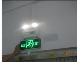
Photo of fire safety equipment Emergency light and exit sign testing.JPG