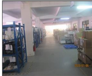
Photo of the inside of the main production hall Warehouse.JPG