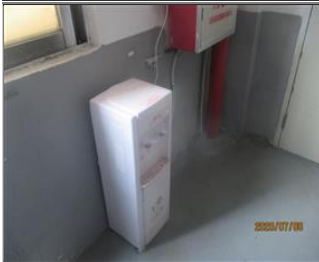
Photo of the sanitary facilities Drinking water area.JPG