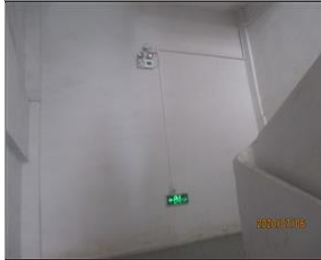
Photo of fire safety equipment Emergency light and evacuation sign in stair.JPG