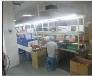
Photo of the inside of the main production hall Packing.JPG