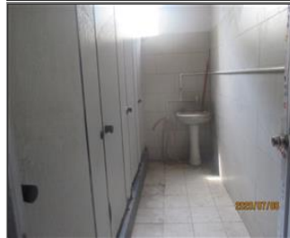
Photo of the sanitary facilities Restroom.JPG